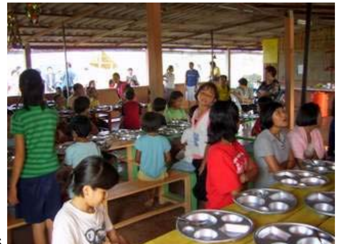
games gotten ready to serve.